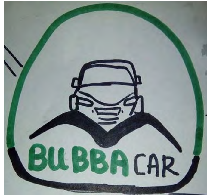
The first revolutionary car for the disabled.

different fear foreign humanrights immigrants integration racism refugees stereotype xenophobia