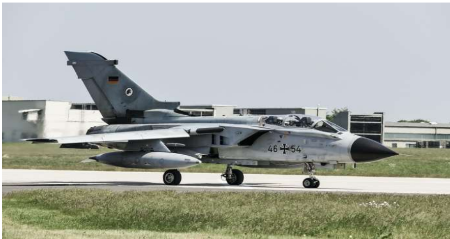
Fighter jet „Tornado“ as a product from Italy, France and Germany.